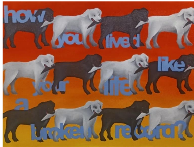
Figure 2. mammon