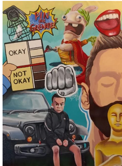
Figure 4. imagine world being ruled this way...