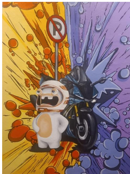
Figure 1. how could you ignore the sign?