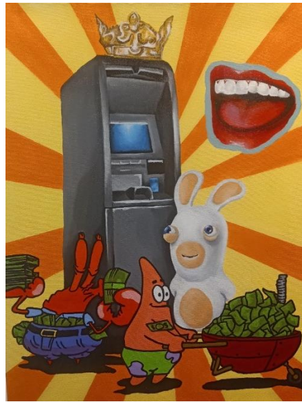
Figure 3. how you lived your life like a broken record?