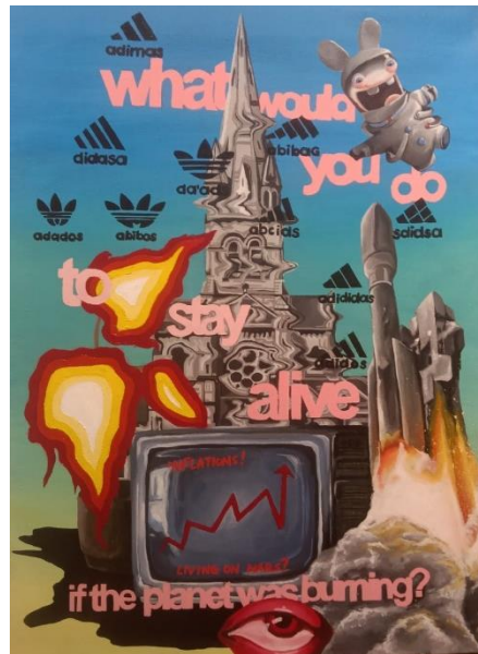
Figure 3. WhatWouldYouDoToStayAlivelfThePlanetWasBurning?