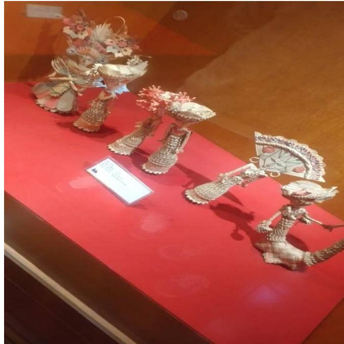
Figure 2. Cili (Dewi Sri), Bali Museum Collection