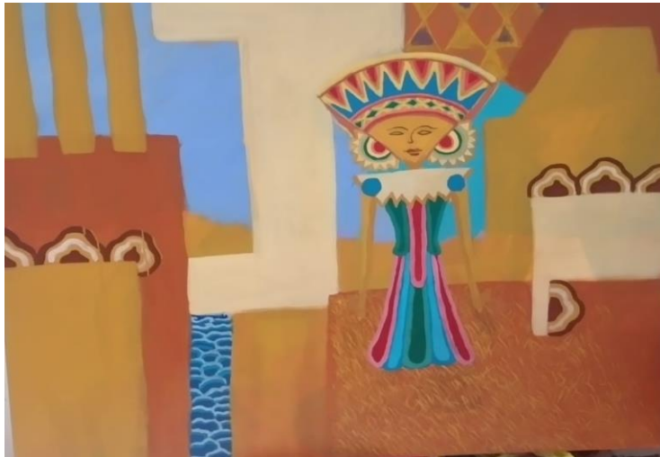
Figure 3. "Dewi Sri", 120x100, Akrilik Di Kanvas

The meaning of chili in Balinese culture is closely related to the ceremonies in agricultural life that most people participate in. In this case, chili becomes a symbol of the embodiment of Dewi Sri as the goddess of fertility, prosperity of the Mother Goddess or Mother Earth, from whom the land or Mother Earth produces all human needs, for example plants and others. In relation to the field of rice farming, a ceremony is held to worship Bhtari Sri as a symbol of fertility and prosperity in a series of rice harvest ceremonies, then successive ceremonies are carried out, after the rice is 3 months old, the meibyakukung ceremony is carried out. made from palm leaves. Then, two days before the rice was harvested, an embodiment called Nini Pantun (Goddess of Rice) was made in the form of a woman with 54 stalks of rice and a male incarnation with 108 stalks of rice. These two embodiments are then married in a rice barn which aims to ensure good and abundant harvests.