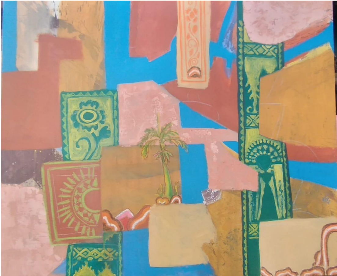
Figure 5. Lamak