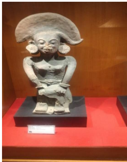
Figure 1. Cili terracotta, Bali Museum collection

This basic research stage is intended to find information about the Kamasan Classical Painting style and the stages of creation, which will later be collaborated with the concept raised. Not only regarding technical creation, in this stage the author also conducted research on cili as an idea for creating works. Cili is a statue depicted with a slim-waisted female figure with a large headdress and subeng. The ingredients used for chili include coconut leaves, palm leaves, soil and some are made from flour. Here's a photo of the cili: