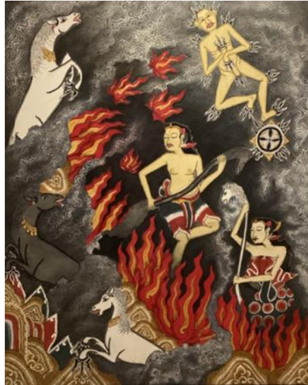
Figure 2. Kerauhan