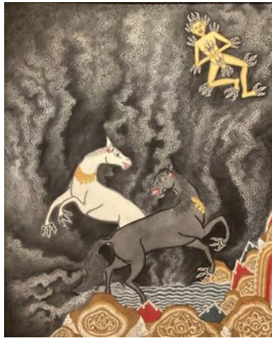
Figure 2. Mesiram