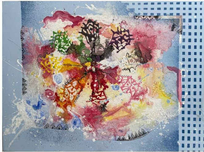
Figure 3. Figure The Solar System, mix media, 60x60, 2024 [Source: Agung Bayu Pratama]

The underlying message of this piece is that all elements of nature possess their own souls, just like objects do. It encourages appreciation for everything that exists in the world, with a hope that peace will always accompany humanity.