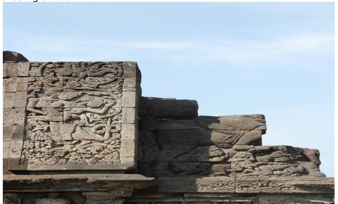
Figure 1 North panel relief of Candi Surowono,

The male and female figures are carved as they are walking on triangular motifs. The artist's unique artistic charm has been manifested through sculptures of seven-petal flowers, which are visualized growing from buds sticking out, fully developed. This motif reinforces the artistic carrying of the expression of closing the eyes, the closeness of the anatomy of the body, and the feeling of love.