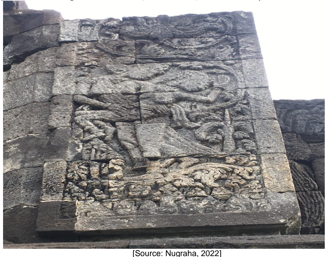
Figure 2. Detail of the sculpture of adengan holding on one of the panels (north side) of the Candi Surowono

full dress, crown, hair in a bun, equipped with various jewelry on the arms, wrists, and ankles. This male figure sculpture manifests in a very strong expression showing a sense of love, tenderness, and femininity.