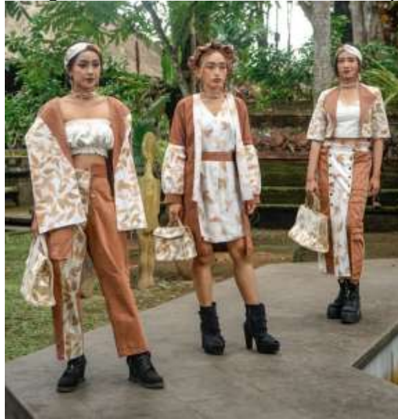
Figure 5. Swakaryaloka Memories

Creativity and innovation in the Swakaryaloka Show is a collection of memories that are dominated by a brownish red color (burnumber) in accordance with the beginning of the water pollution in the Tukad Badung river in 2019, due to the home industry's behavior making the water color red. The collection of memories uses a natural dye technique using coconut fiber and an eco print technique using weed leaves of the Biden Pilosa type.