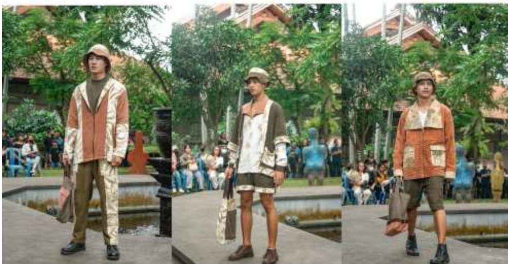
Figure 6. Contemporary Swakaryaloka

Contemporary designs mixed and matched by red and green materials, are in accordance with the current work process, where pollution did not only occur in 2019, but continues to this day.