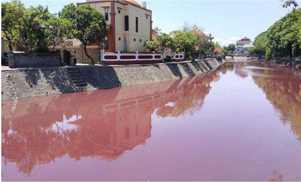
Figure 1. Tukad Badung River Water is Red

water transparency and block light penetration and oxygen transfer to the bottom of the water so that it can interfere with the photosynthesis process of phytoplankton or aquatic plants which can then result in the death of aquatic biota. Therefore, synthetic dye waste that is disposed of directly into the environment without being processed first can pollute the environment and is very dangerous to ecosystems in rivers, lakes and seas (Denpasar City Government, Environmental and Hygiene Service, interview, 23 November 2021).