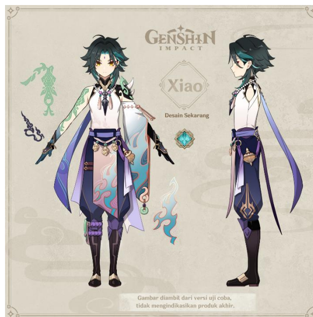
Figure 1. The Costume of Xiao: “Vigilant Yaksha” in Genshin Impact (Zhongyuan, 2021)

Visually, Xiao's costume incorporates elements that resemble traditional Chinese garments, particularly through the use of a high collar structure and layered clothing composition. The costume is also decorated with ornamental motifs that resemble stylized cloud and wind patterns, which are commonly found in Chinese visual culture and are associated with harmony, spiritual movement, and the connection between the human and the divine realms. Rather than functioning purely as decoration, these motifs reinforce the character's identity as an Adeptus and a being associated with transcendental forces. From a visual hermeneutic perspective, these elements can be interpreted as representations of Xiao's dual identity. The structured form of the costume reflects discipline and restraint, while the flowing and dynamic elements symbolize freedom and spiritual transcendence. This combination constructs a visual narrative that reflects both stability and movement, aligning with the philosophical and symbolic meanings embedded within the character design.