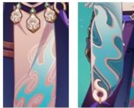
Figure 6. Cloud and Wind Motifs on Xiao's Costume in Genshin Impact (Zhongyuan, 2021)

As illustrated in Figure 6, the cloud and wind motifs in Xiao's visual design in Genshin Impact are not merely decorative elements, but rather convey profound symbolism related to nature and the dynamics of life. Clouds, often associated with uncertainty and transformation, reflect the transient and ever-changing nature of the life experienced by the character. Wind, as the Anemo element, is not only central to Xiao's combat abilities but also functions as a philosophical symbol. It represents freedom, vitality, and constant change. From a hermeneutic perspective, these symbols construct a narrative of Xiao's journey as an immortal being within the game. This interpretation provides insight into how the character navigates existence with a sense of freedom inherent within his nature.