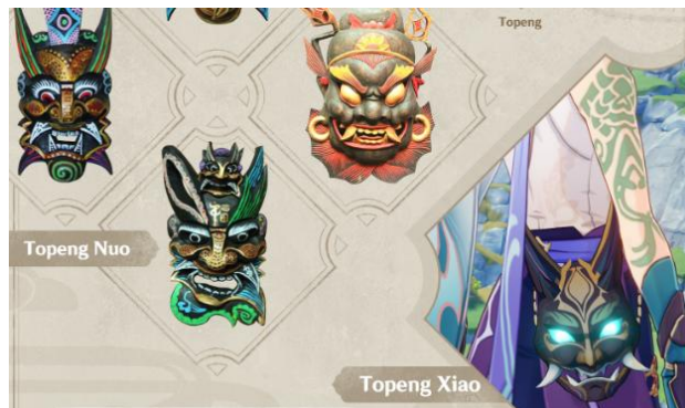
Figure 4. Nuo and Yaksha Mask (Zhongyuan, 2021)

One of the most prominent symbols in Xiao's costume design is the "Yaksha" mask carried by the character in Genshin Impact. This Yaksha mask is inspired by the Nuo mask from Chinese cultural and religious traditions, which is traditionally used to ward off evil spirits, disease, and to invoke blessings during ritual performances, particularly at the end of the Chinese New Year celebrations (Fukushima, 2005). In both Hindu and Buddhist traditions, the term "Yaksha" refers to supernatural beings endowed with extraordinary powers (Sutherland, 1991). This symbolism connects Xiao to transcendental forces and emphasizes his exceptional combat abilities. Furthermore, the "Yaksha" mask embodies spiritual values and protective functions. Xiao, known as the "Bane of All Evil," utilizes this symbol as a manifestation of courage and determination in confronting and overcoming dark entities.