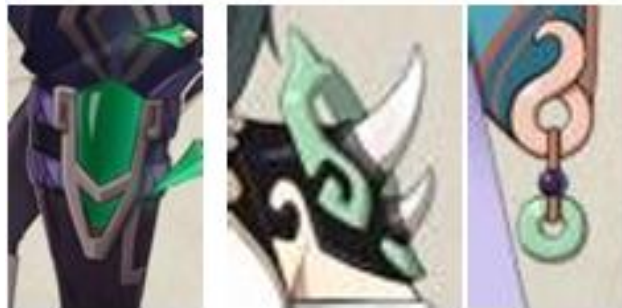
Figure 5. Jade Accessories (Zhongyuan, 2021)

As illustrated in Figure 5, jade symbolizes success, prosperity, and good fortune. It is also widely regarded as a symbol of longevity and even immortality. Green jade, in particular, is the most common type and is often associated with the concept of heaven or the divine in religious rituals (Taube, 2005). In ancient Chinese medical beliefs, jade powder mixed with water was considered an elixir capable of strengthening the body and prolonging life. For the deceased, this substance was believed to slow the process of bodily decomposition (Prasetya & Anggapuspa, 2022). From a hermeneutic perspective, the presence of jade in Xiao's character design in Genshin Impact can be interpreted as a symbolic reference to his divine origin and his existence as a long-lived, celestial being.