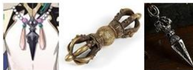
Figure 7. Xiao Necklace (Prasetya & Anggapuspa, 2022)

As illustrated in Figure 7, Xiao's necklace in Genshin Impact is an adaptation of the Vajra . In Sanskrit, the Vajra refers to an ancient weapon symbolizing both lightning representing immense power and the diamond, signifying indestructibility (Campbell, 2009). In Buddhist traditions, particularly within Tibetan culture, this object is also associated with the phurba (or kila ), a ritual dagger commonly used to subdue evil spirits and eliminate spiritual obstacles. The phurba is typically crafted from precious metals, bone, or composite materials, symbolizing a powerful instrument for warding off malevolent forces. The dagger-like form at its tip represents the act of confronting and cutting through the three fundamental roots of negative traits: ignorance, desire, and envy. These three sides also symbolize mastery over the past, present, and future (Prasetya & Anggapuspa, 2022). Within Xiao's character design, the use of the Vajra serves as a symbolic synthesis, combining the meaning of the vajra as an indestructible and supreme force with the vajrakilaya ( phurba ) as a ritual weapon used to defeat evil entities.