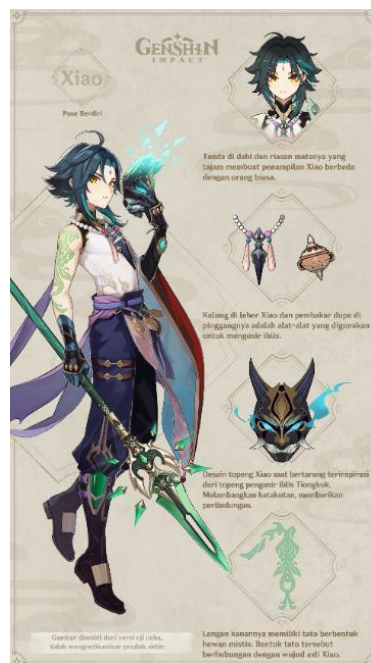
Figure 3. Character Design Details of Xiao in Genshin Impact (Zhongyuan, 2021)

The symbolism embedded in Xiao's visual design in Genshin Impact does not merely function as decorative embellishment, but also incorporates layers of profound philosophical meaning. Within the framework of visual hermeneutics, this study explores the symbolism inherent in the character's design, uncovering insights into the values, beliefs, and philosophical concepts that underpin it.