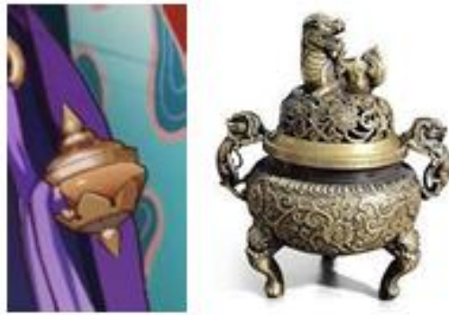
Figure 8. Waist Ornaments (Prasetya & Anggapuspa, 2022)

Meanwhile, as illustrated in Figure 8, the waist ornament worn by Xiao in Genshin Impact is adapted from a censer, a vessel traditionally used for burning incense or aromatic substances, particularly in religious rituals. Such objects are commonly made from materials such as bronze, stone, porcelain, or copper, and are produced in various forms, sizes, and engraved patterns. Censers have been utilized for centuries across different cultural contexts. In China, censers are typically filled with dried aromatic plants or scented oils and are used in religious ceremonies, including funeral rites and offerings of prayer (Staub et al., 2011). The necklace and waist ornament together reflect the mystical and spiritual dimensions of Xiao's character. These elements contribute to the impression of longevity and reinforce the character's enigmatic and otherworldly presence.