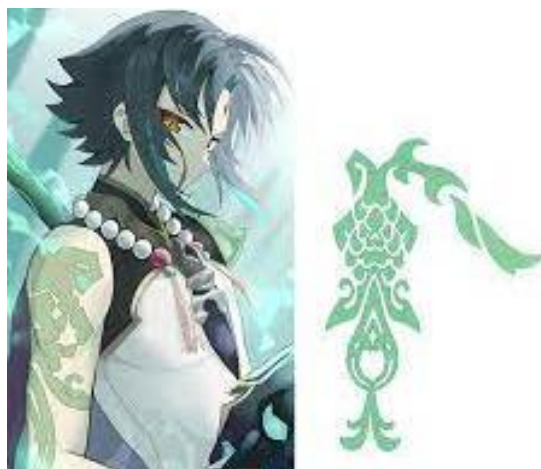
Figure 9. Xiao's Tattoo in Genshin Impact (Anonim, 2023)

As illustrated in Figure 9, the tattoo on Xiao's right arm in Genshin Impact reflects his identity as an Adeptus and a spiritual guardian of Liyue. The tattoo takes the form of a mystical creature associated with Xiao's original form, resembling the Fenghuang from Chinese mythology. From a hermeneutic perspective, this element can be interpreted as a representation of Xiao's longevity and immortality, reinforcing his status as an eternal and transcendent being. Beyond its symbolic representation, Xiao's visual design also reveals an internal contradiction that reflects a deeper hermeneutic tension. While the costume elements project divinity, elegance, and spiritual authority, other visual aspects such as the darker color tones, sharp facial expression, and Yaksha identity suggest suffering, violence, and psychological burden. This contrast indicates that Xiao is